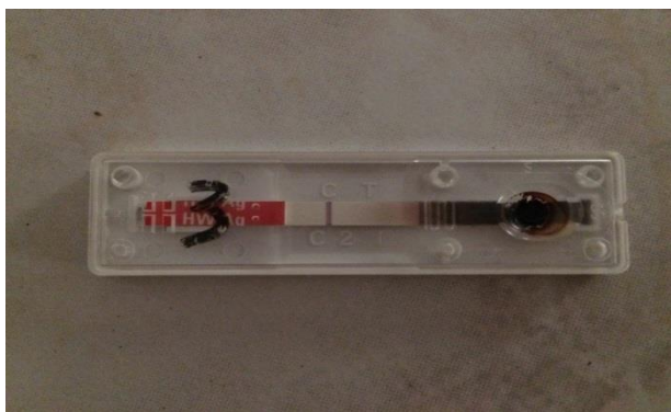
Fig. 2. Rapid antigen test for detection of D. immitis infection in dogs in Urmia district.

The dogs were from different breeds including Sarabi (Persian mastiff), German shepherd, Terrier and Boxer (Table1). Regarding epidemiology of the D. immitis , dogs with age of above 1 year old entered to the study. Three age groups of the dogs including 1-3, 3-5 and >5 years old were compared by both modified knot method