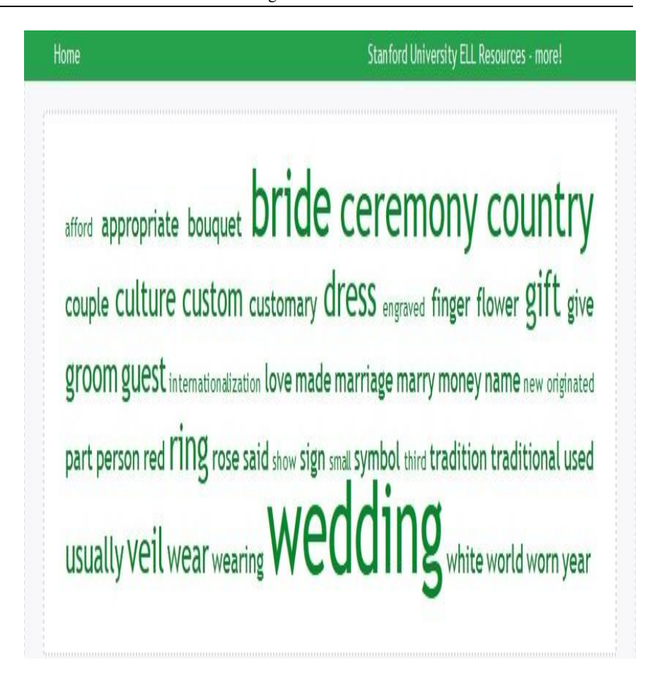
Figure 1. Word Cloud Orovided by Wordsift

A word cloud is a visual representation for text data, typically used to depict key word metadata on websites, or to visualize free from the text.