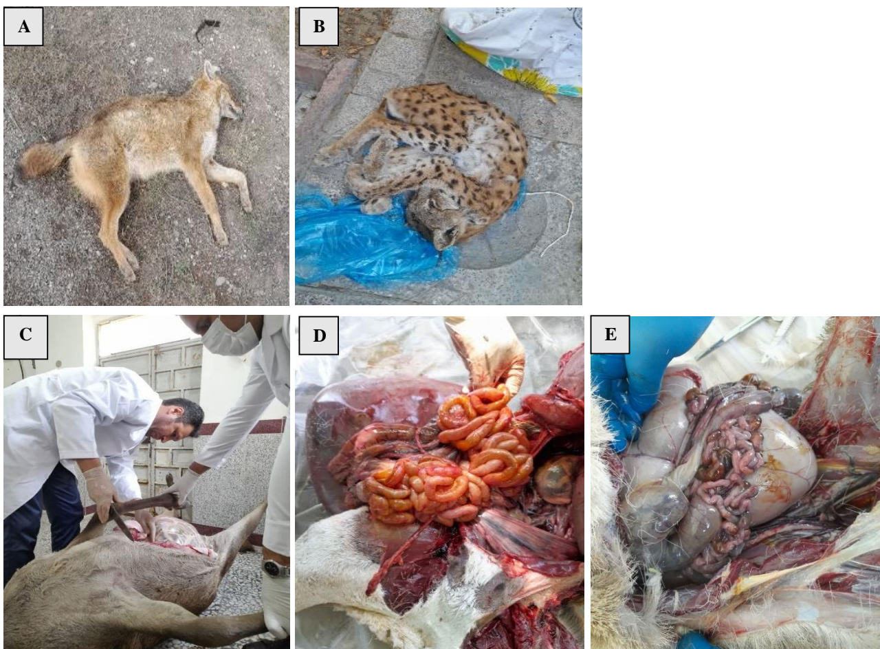
Fig. 1. A: A common fox that died in a road accident. B: Losses of Eurasian lynx due to conflict. C, D, and E: Mesenteric lymph nodes and liver tissue were collected from intermediate hosts.

the investigation and observation of these parasites. In addition, this approach facilitates the visualization of both the right and left nasal cavities and allows the detection of any lingual parasites. For better diagnosis, the samples were referred to the laboratory and they were washed with a gentle stream of water and a 300 sieve. For herbivores, the liver and mesenteric lymph nodes were harvested postmortem and subsequently immersed in lukewarm water following a transverse incision. The lukewarm water relaxes the parasite and the use of a revision loop increases readability while preserving the essential details of the original text (Figures 1 and 2).