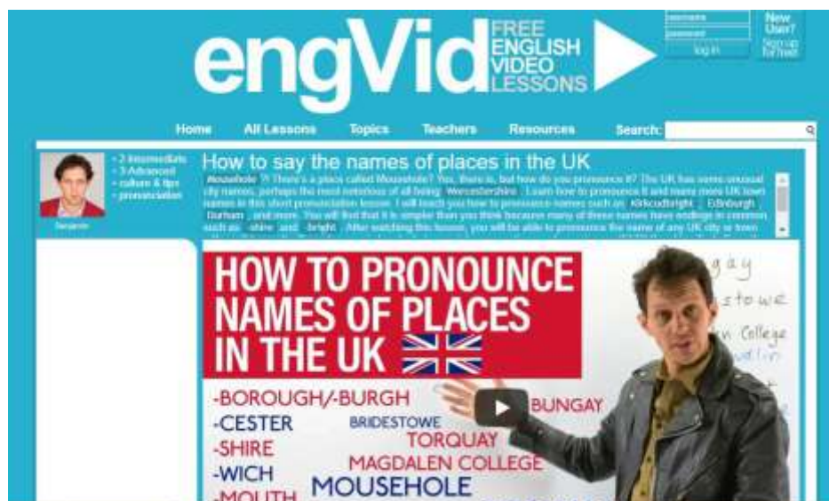
Figure 1. EngVid. Retrieved from https://www.engvid.com/ . Screenshot by author.

Thus, it can be said that the EngVid YouTube channel is a platform for sharing different English learning videos that offer advice and methods for learning the language. In addition, this channel emphasizes learning the language more, particularly speaking.