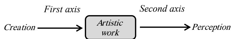
Figure 1: Two axes of the work of art based on Jauss's perspective

From Jauss' perspective, a work of art has two axes: creation and perception (Figure 1). In his point of view, the reader is not a mere discoverer, but he is a creator. He limits himself to neither representing the truth nor the history and the past. Jauss introduces the concept of the horizon of expectation to explain his theory (Namvar Motlagh, 2008: 90-100), i.e. how the audience, as the main element in perception, has an aesthetical perception that refers to his horizon of expectation.