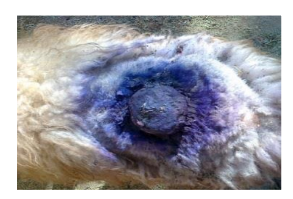
Fig.1. The tumor-like mass with a rough surface on the back of the affected sheep.

A six-years-old native ewe with major clinical signs, including nasal discharge, enlarged superficial lymph nodes, and anorexia, was referred to a veterinary clinic in Najafabad, Isfahan province, Iran. Also, there was a round tumor-like mass about 23.2 cm \times 3.5 cm in diameter on the back area (Figure 1). The mass was alopecic, and its surface was rough. At the first step, the mass was removed, but after two weeks, it was appeared again. A sample from the tissue formed on the back of ewe was isolated and placed in 10% formalin and 37% paraffin and then was stained with hematoxylin and eosin (H&E) histopathological examination.