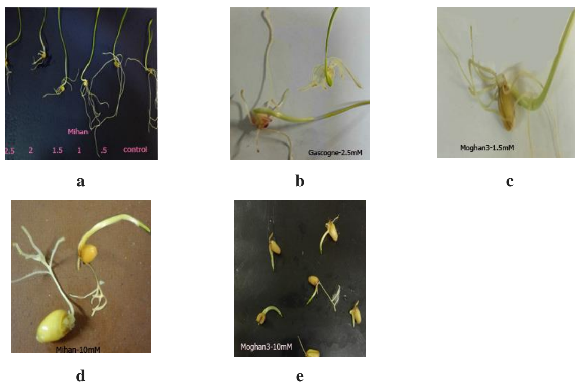
Figure 1. The effect of Al 3+ toxicity on wheat root characters: a) Decreasing root length, b) Black root tips, c) Increasing number of root, d) increasing branch of roots and e) Germination of Moghan3 variety in 10 mM Al 3+ concentration

Means with the same letter in each column are not significantly different at 1% probability level