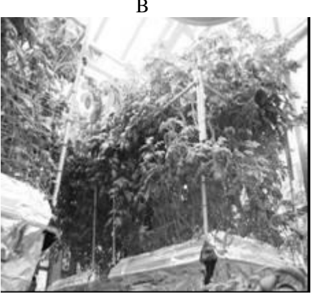
Figure 2. A: Growth and development of roots in the aeroponics system, B: Growth and development of stems in the aeroponics system

were measured. All tubers larger than 20 mm in size were removed at each harvest. Similar traits were measured in the conventional soil system in the greenhouse. Experiment was carried out as factorial based on completely randomized design layout with 10 replications. Potato cultivar (Agria, Marfona and Savalan) was regarded as the first factor and production system (AP, Aeroponics production system; SP, soil production system) as the second factor. The quality characters of the minitubers for both production systems (AP, SP), including minituber germination after the dormancy period, stem length and yield were measured.